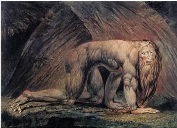
William Blake's famous picture of Nebuchadnezzar changed to a beast.

Though a year passed and it must have seemed to Nebuchadnezzar that the dream would never come true, it suddenly came to pass in a moment of time, when his pride and arrogance had hit its pinnacle. Like a crashing hard drive, the dream's prophecy suddenly descended on the king. None of his