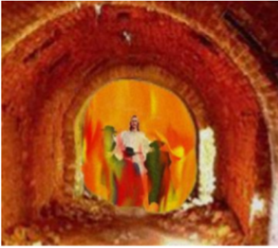
Three Men in the Fire

The three men were finally dragged away and bound in their cloths to be thrown into the furnace. The three were “ bound in their coats, their hosen, and their hats and their other garments and were cast into the midst of the burning fiery furnace. ” Dan 3:21 They did not suffer the humiliation of being naked. They were taken, fully bound in their garments. An odd thing to do to men you are about to roast. But the spiritual symbolism is apparent. We are given a picture book lesson to be aware of our spiritual garments. What have you clothed your spiritual countenance in, brothers and sisters? These men were clothed from head to foot. They had a hat (of salvation); hosen (to cover their legs and feet for the preparation of the gospel of peace); coats (of praise) and other garments