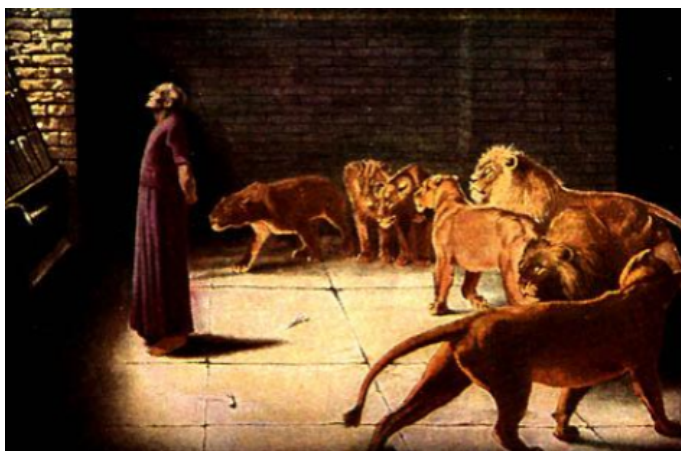
Daniel In The Lions Den by Briton Riviere

Reaping What We Sow: Out of the Lion's Mouth