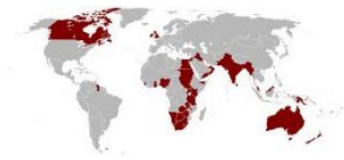
British Empire 1920's

This was her ultimate moment; and yet it also heralded the beginning of the end for her and the Gentile world which she represented, because it was all downhill from there. It was also destined that her prodigy America should be at that very moment on the ascent. But Great Britain had accomplished its prophetic purpose in the hand of Providence.